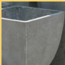
POT SA BOLLIVIA LARGE